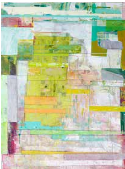
"River Walls", acrylic on aluminium, 135 x 100 cm